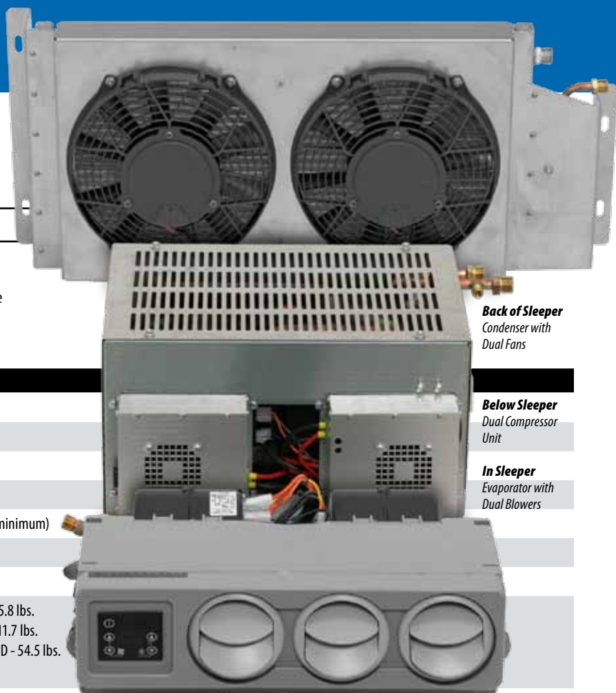
Back of Sleeper Condenser with Dual Fans

* figures taken with ambient temperature at 32°C / 89.6°F